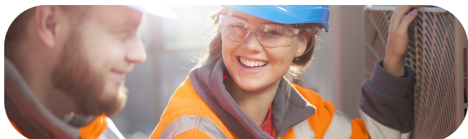
DLT is an Equal Opportunity Employer/Program. Auxiliary aids and services are available upon request to individuals with disabilities.